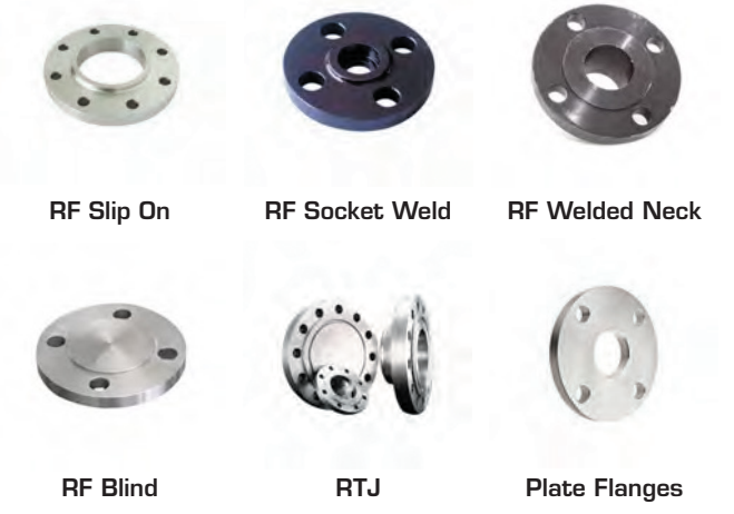
Plate table flanges are available in E,D,F,H standards, for 2" through 16" pipes. Custom and large cut flanges are available to order and can be delivered with very short lead times.