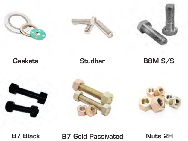
Gaskets Studbar B8M S/S B7 Black B7 Gold Passivated Nuts 2H

A full range of Garlock standard gasket sizes are available ex stock, custom cut gaskets are available to order. Specialist gaskets, o rings, copper gaskets and sealants are available on request.